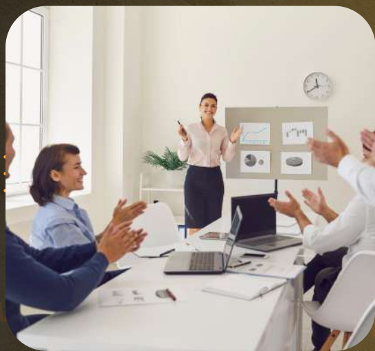
Event Management Companies