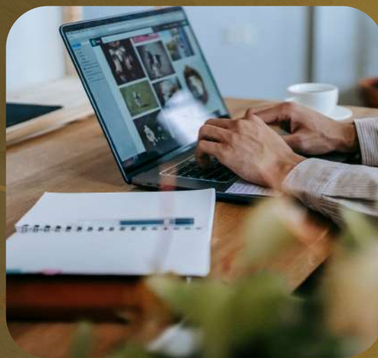
Freelancing or Consultancy