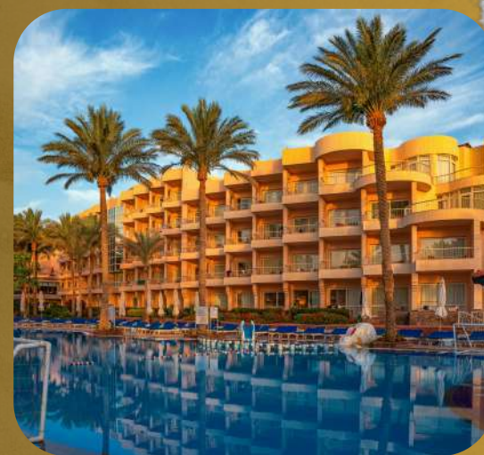
Hotels and Resorts